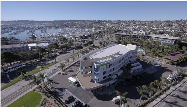
Aerial View of Holiday Inn